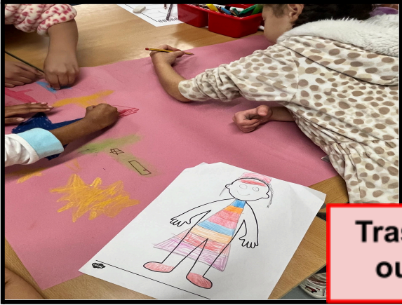
Trash Fashion - Designing an outfit from recycled things